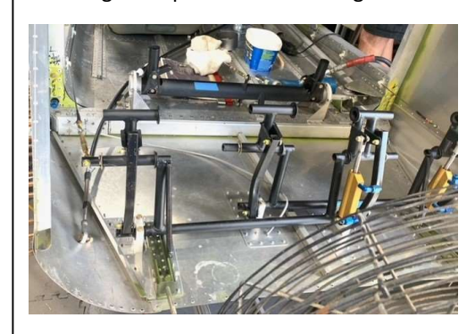
Cessna 150 - Steve Working on cable feed points though win ribs