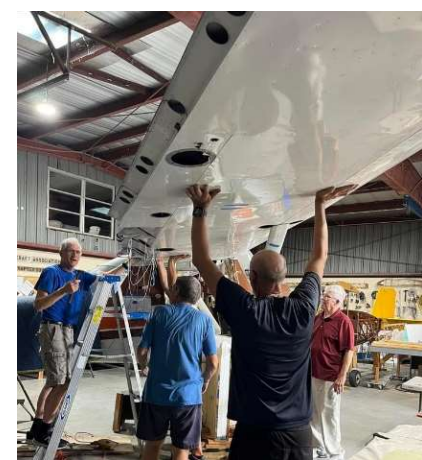
Stinson Future up for discussion